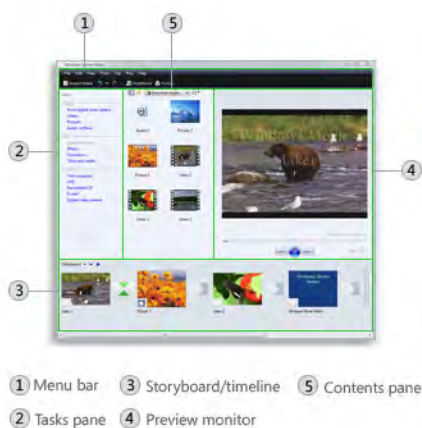
The main areas of Windows Movie Maker

A multi-media presentation, or "movie" as Movie Maker (and many other commercial packages) calls it, is a collection of pictures, videos, and music, organized as a movie, used to tell a story. It may be the story of your latest vacation, your last birthday, the last big holiday, your youngest grandchild, or a pictorial history of someone, something, or some organization. If you have appropriate pictures, videos, and music, Movie Maker can easily put them together to create a movie to express your particular point of view. So, obtaining the pictures, videos and music is usually the first step in producing your movie. Pictures are probably the easiest; you just